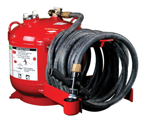
Model 784 Shown