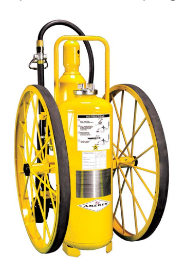
Extension Wand is Standard

Two choices for large volume Class D (flammable metal) protection. Model 680 (Sodium Chloride) is effective on magnesium, sodium, potassium and sodium potassium alloy fires. Model 681 (Copper Powder) designed specifically for fighting difficult lithium fires. Well balanced for quick transport on 36" non-sparking rubber tread steel wheels. Both are pressurized with Argon and regulated to a low 125 psi to avoid disrupting the burning materials.