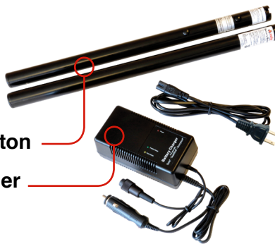
Solo 760 Battery Baton